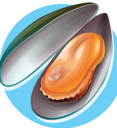
Grow them up until they become big, strong and delicious