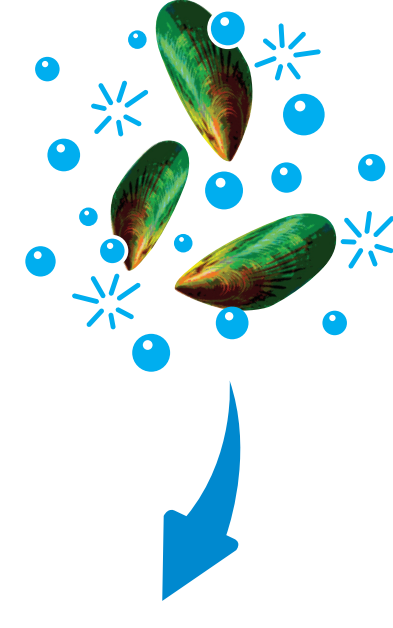
Make lots of families from carefully chosen parents