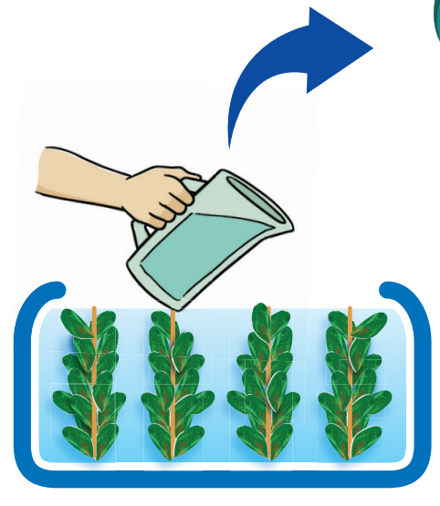
Feed them well until they are ready to transfer to mussel farms